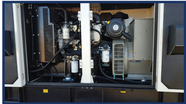
EASY ACCESS FOR MAINTENANCE