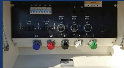
CUSTOMER CONNECTION CAM-LOK STANDARD