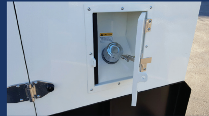
LOCKABLE EXTERNAL FUEL FILL