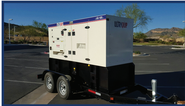
LARGE CAPACITY FUEL CELL

UQ-220: Standby Rating: 220 kVA / 176kW Prime Rating: 200kVA / 160kW