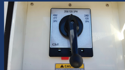
3 POSITION VOLTAGE SELECTOR SWITCH