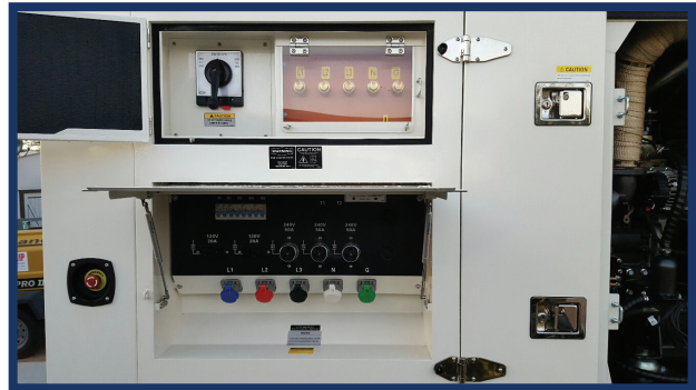
CUSTOMER CONNECTION PANEL