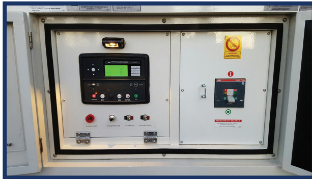
REAR CONTROL PANEL WITH MLCB